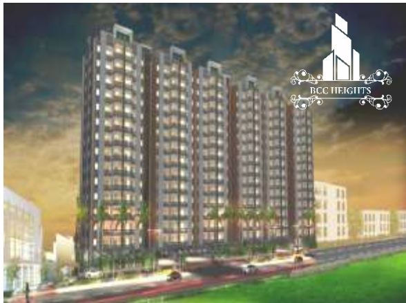
Raibarely Road, Near PGI