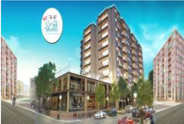
Faizabad Road, Near Saraswati Dental College