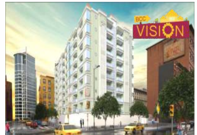
Moti Nagar, Aishbagh Road