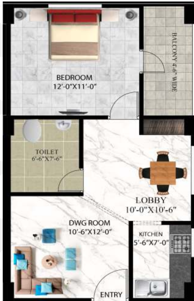
BCC Green 1 bkh W/S, Area 650 sqft