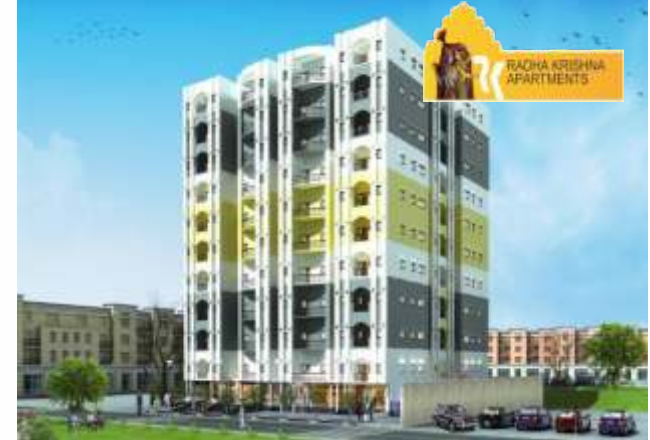
Main 6 Lane, Faizabad Road