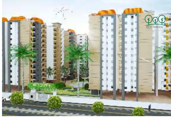
Naubasta Kala, Chinhat