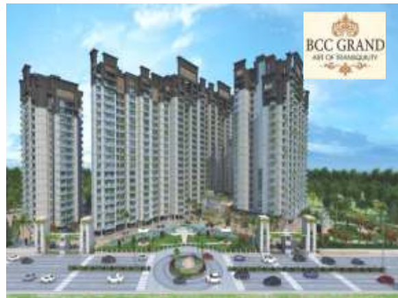
Faizabad Road Near TOI